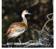
WEST INDIAN WHISTLING-DUCK