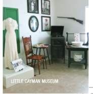
LITTLE CAYMAN MUSEUM