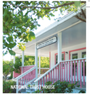
NATIONAL TRUST HOUSE

WE STRIVE FOR NATURAL PERFECTION Please leave the flora and fauna untouched and our beaches and trails pristine. We want our island to still be beautiful when you return.